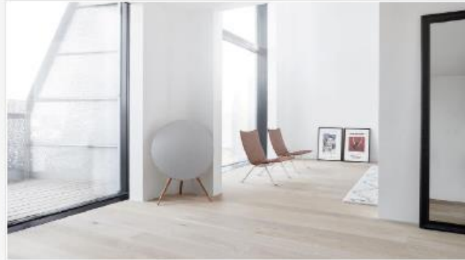
Plank Hardwood Flooring