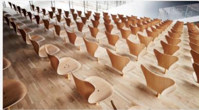
2 Strip Wooden Flooring