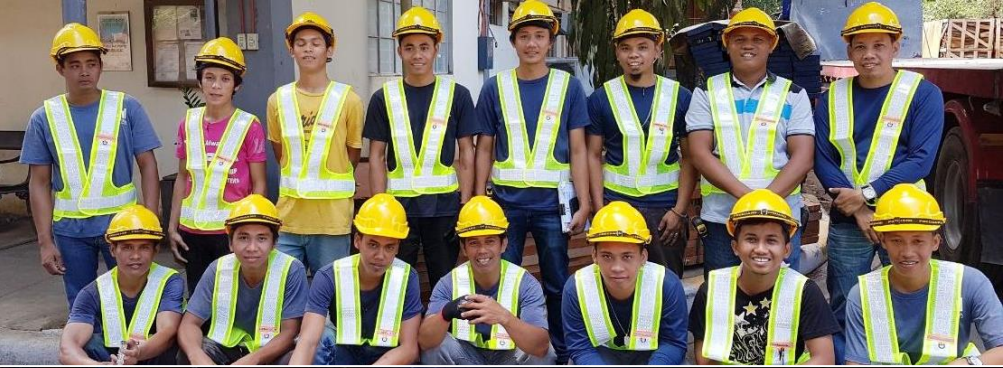
Basketball project in Tacloban, Philippines - 2018