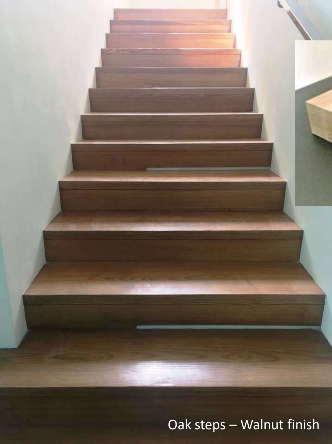
Oak steps – Walnut finish