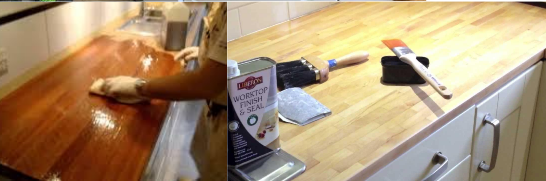
Table tops are easy to renovate by sanding the wood down, and re-oiling. We always recommend oil rather than lacquer for table top finishes – Especially when used for kitchen tops.